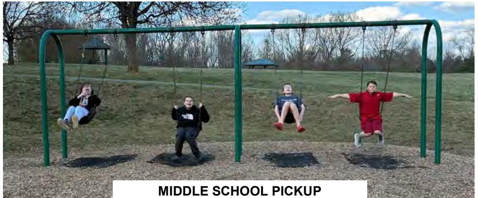
MIDDLE SCHOOL PICKUP